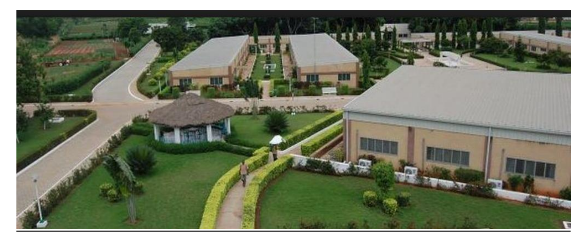
Pictures of the CIEVRA (Center for Experiments and Valorisation of African Resources) created by Fondation Espace Afrique in the Benin Republic to develop the autonomy of rural populations through implementation of organic farming, agro-food and health projects

In 2016, Fondation Espace Afrique has carried on with projects it conducts by itself or in parnership with other organizations (financing schools, offering scholarships for students, etc). In 2016, Fondation Espace Afrique has also signed new agreements of partnership in the agro ecological field and in education with 3 organizations, Mercy Ships, Conférence des Evèques Suisses and the Saint Thomas d'Aquilin Catholic University of Ethiopia